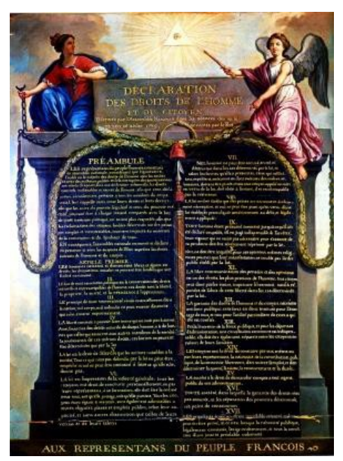
Declaration of the Rights of Man, by Jean- Jacques-François Le Barbier (1789)

A 1905 law officially separated church and state, and the government grants no direct funding of any religious group (though officially recognized groups do receive certain tax exemptions, and churches and synagogues built prior to 1905 are maintained by the state). Following the 1905 Act, religion was understood be part of the private lives of French citizens, while its institutional roles were assumed by