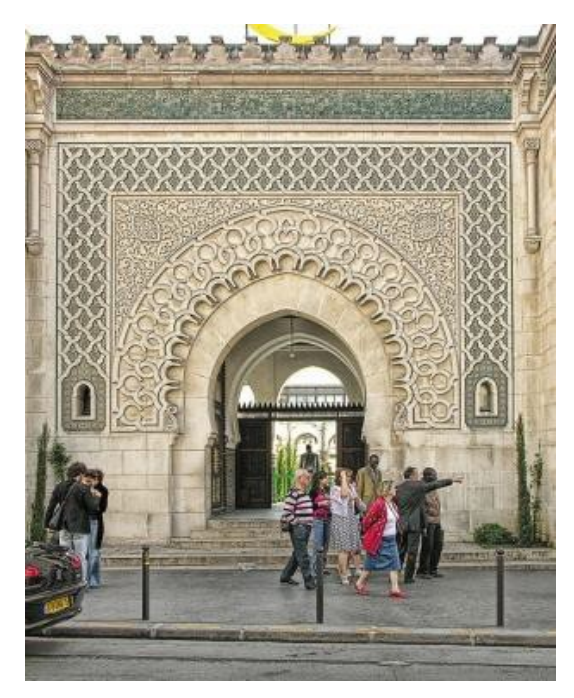
Grand Mosque of Paris (2008)

In North and West Africa, the mission meant active opposition to, dismantling, and the reconstitution of local religious institutions. In West Africa, colonial leaders forged ties with mainstream Islamic institutions while suppressing alternative and potentially destabilizing expressions of Islam, such as Sufi brotherhoods. <sup>20</sup> This latter aspect was particularly noticeable in North Africa where anti-colonial resistance was often expressed in Islamic terms, for example, as a military jihad , led by political and spiritual leaders like Abdul Qadir al-Jaza'iri in Algeria.