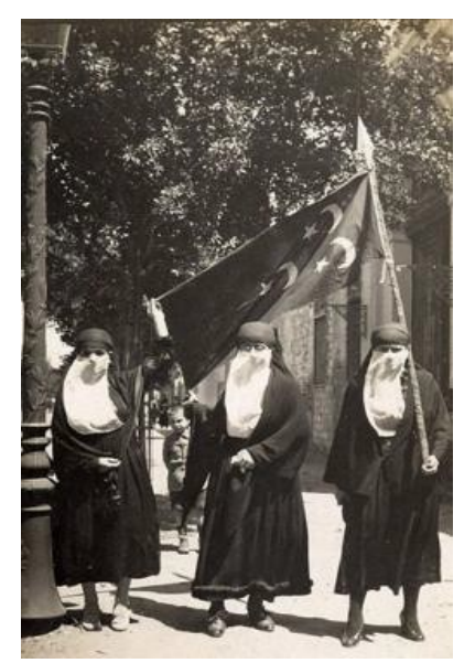
Veiled protesters in Cairo (1919), photographer unknown, <u>Wikimedia</u> Commons

Finally, the discourse of veiling is grounded in the history of France as a colonial entity; within the