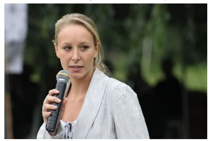
Marion Le Pen (2012), Gauthier Bouchet, Wikimedia Commons

France is a founding member of the twenty-eight state European Union (EU), an economic and political organization of European nations that shares a market, a currency (the Euro), trade policies, and various other institutions. France is the second largest economy within the EU "euro zone," and is generally considered to be an economically prosperous nation, but the country's economic health has fluctuated over the past seventy-five years. These and past economic downturns have contributed to